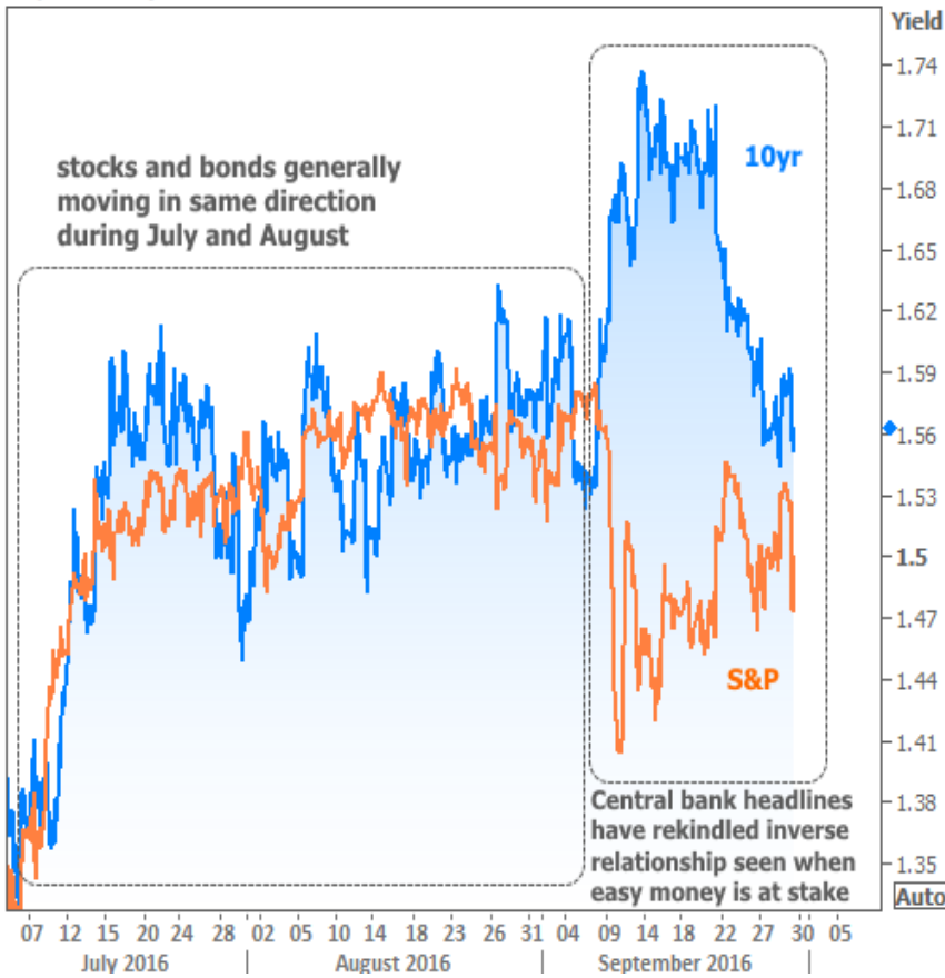
10yr Treasury Yield and Stocks

Subscribe to my newsletter online at: http://mortgageratesupdate.com/mattstoutmortgagenavigator