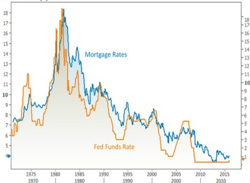
Fed Funds vs Mortgage Rates

Away from the minutia of day-to-day rate movements, the mortgage market has bigger fish to fry . Last week we discussed the precipitous impact from the not-so-precipitous TRID (TILA-RESPA Integrated Disclosures) implementation in October.