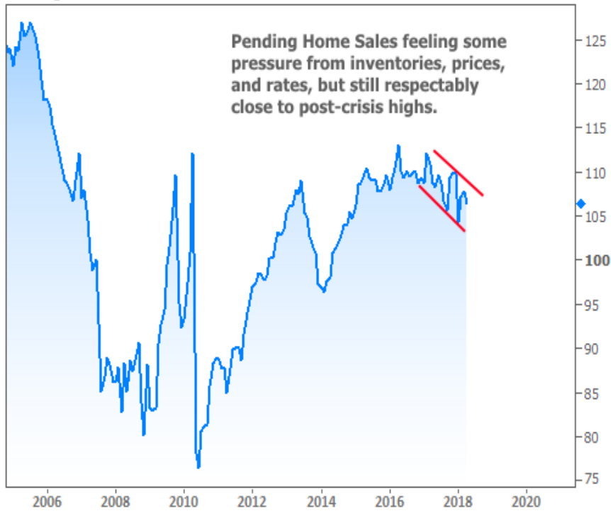
Pending Home Sales