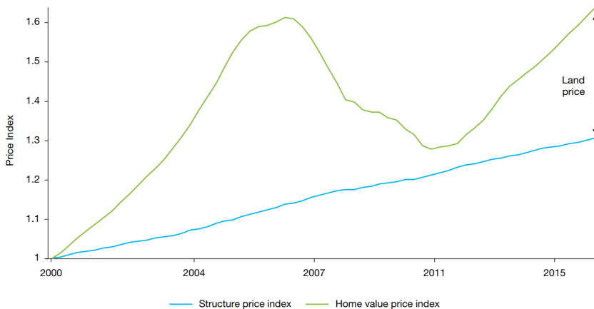
Share of land price in home value