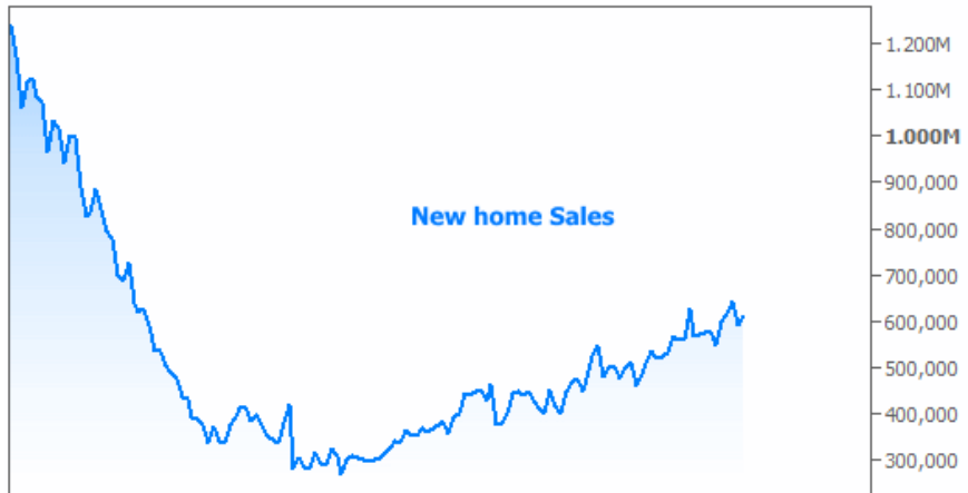
New home Sales