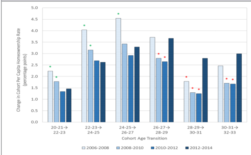
Exhibit 2. During the Early Recovery, Homeownership Gains Accelerated for Millennials Aging Through Their Late 20s and Early 30s

This pattern of aging into homeownership slowed dramatically as the housing crisis in 2008 moved into recession in 2010. For those aging between 24-25 and 26-27, homeownership from 2008 to 2010 grew less than 3.5 percentage points, a point less than in the cohort that age two years earlier. These birth cohort gains continued to decrease between 2010 and 2012, but the loss moderated and for those in their late 20s and early 30s, homeownership rate gains largely stabilized. Between 2012 and 2014 the deterioration ceased for almost all age transitions. For those Millennials who aged between 28-29 and 30-31, the gains during the early recovery period were twice as large as they were for the predecessor cohorts during the housing bust, and even significantly larger than it was for the cohort passing through this age range between 2006 and 2008.