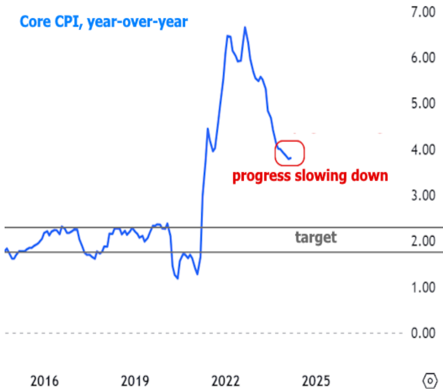
Core CPI, year-over-year

The Fed continues to remind the market that inflation progress is a bumpy road and that these recent setbacks aren't necessarily evidence of defeat. After all, the year over year trend still looks OK despite leveling off a bit from its previous trajectory.