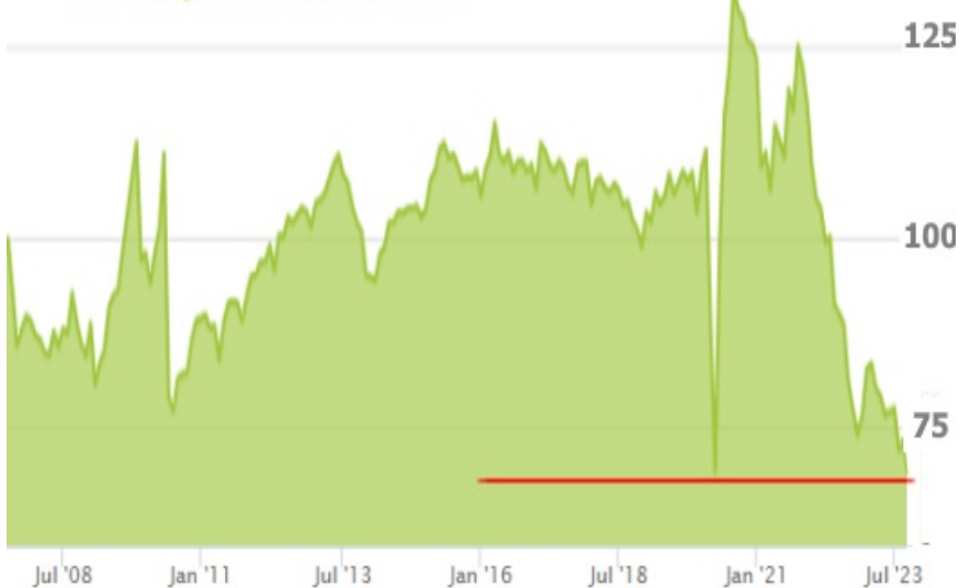
Pending Home Sales Index