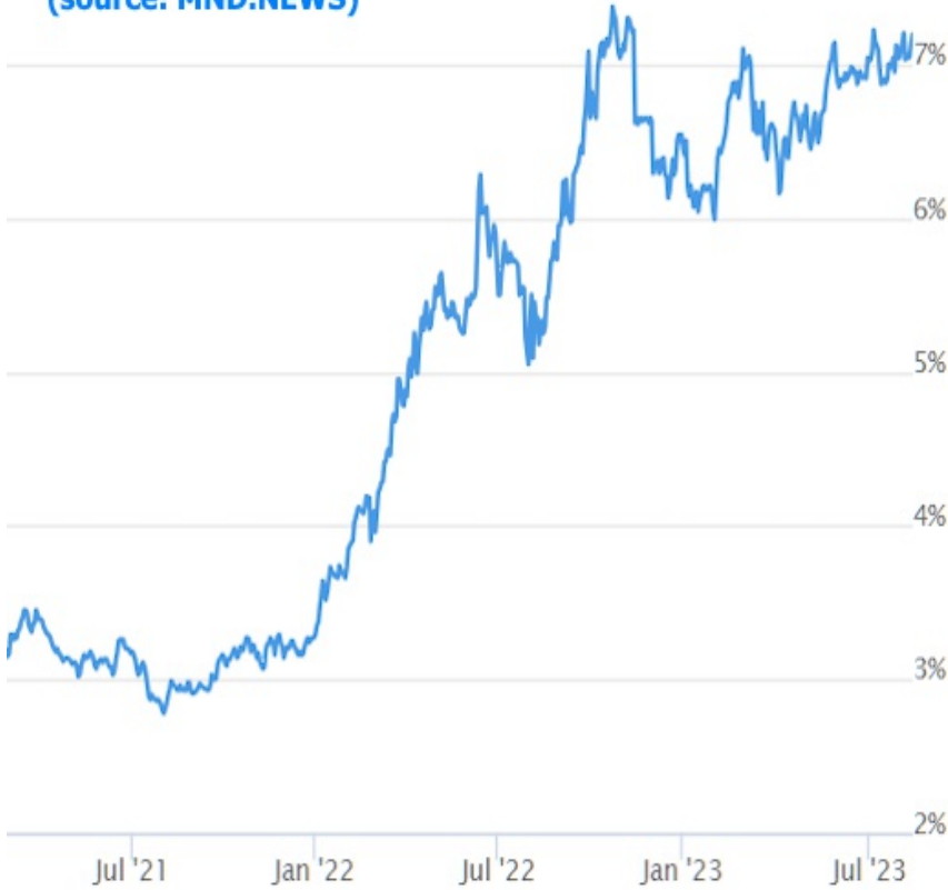
30yr fixed mortgage rate index

This is the new and persistent reality until one of 3 things happens: