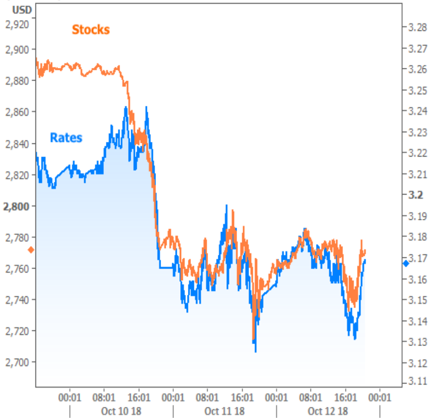
10yr Treasury Yield vs Stocks

The net effect was that mortgage rates fell back to their lowest levels since last Thursday by the end of the week. You may have seen news stories over the past two days talking about a "sharp move higher" in rates. This has to do with stale underlying data used by many media outlets to write their once-a-week mortgage rate article. The sharp move higher occurred LAST week , as we discussed at the time.