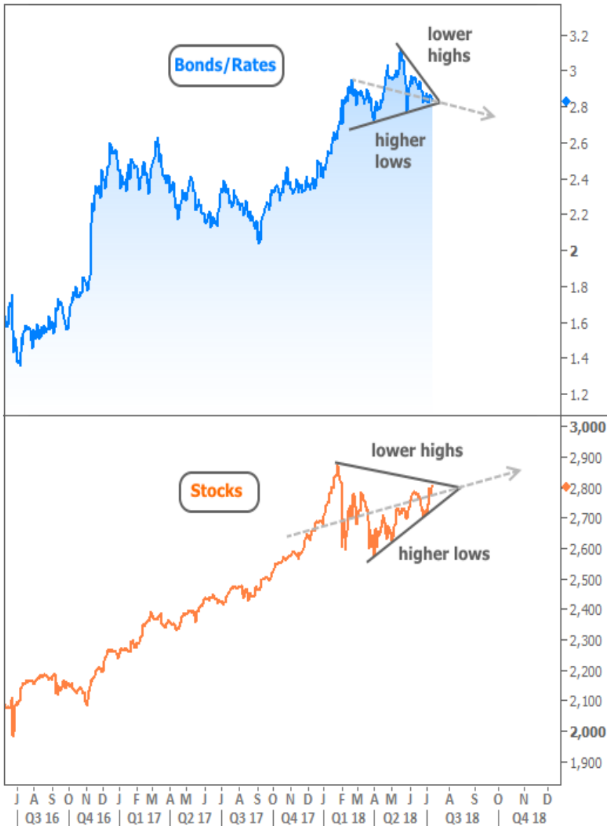
Stocks vs Bonds

In other words, neither side of the market is telling the truth OR lying. Both still aren't exactly sure which way the next move will go. If past precedent is any guide, we may be waiting to find out conclusively until the summertime trading slowdown ends in September. Either way, the presence of these consolidations greatly increases the odds of a bigger move on the horizon.