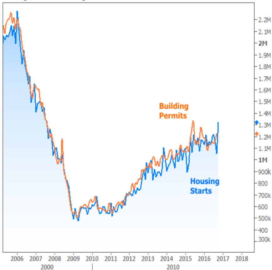
Housing Starts and Building Permits

Subscribe to my newsletter online at: http://mortgageratesupdate.com/jeffschlesinger