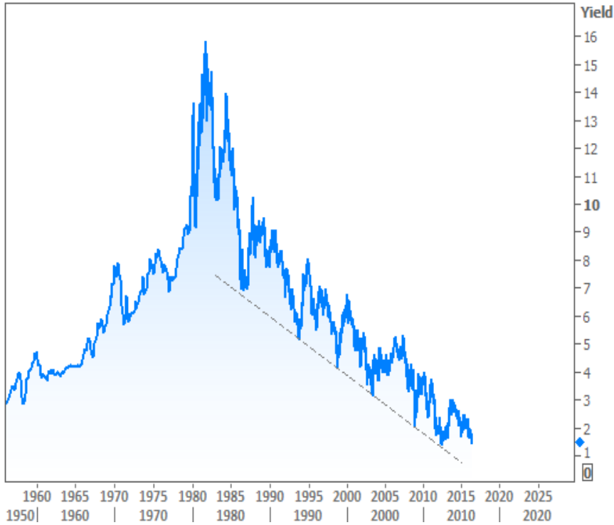
10yr Treasury Yield

Most would assume that falling interest rates have limits and that we'd see those limits the closer we got to zero, but a quick glance at Japanese and European equivalents to the US 10yr yield shows us that "zero" was no deterrent to that downward momentum.