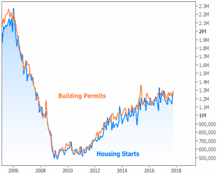
Starts and Permits

Even after the next round of data (which includes homes that COULD be affected by tax changes), we should remember two things. First, at least when it comes to Starts and Permits, the contracts for new construction and ground-breaking for November's numbers will largely have been in place before the November 2nd cutoff. Therefore, to whatever extent potential tax changes spook the housing market, we wouldn't see it in these numbers until January at the earliest.