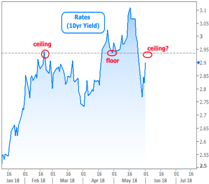
US 10yr Yields