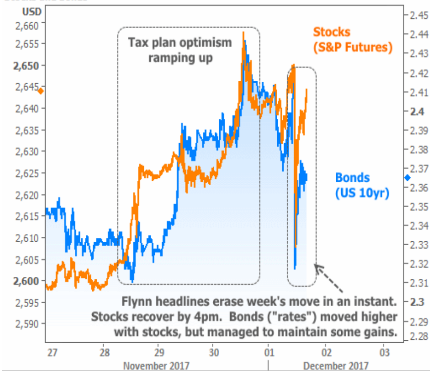
Stocks and Bonds

The decline in bond yields brought rates back into that "narrower range" as seen in the following chart, but only for a few hours. With more clarity on the Flynn news (i.e. no specific mention of Trump), stocks and rates eased back toward the morning's levels. Rates remained in better shape on the day, but still on the wrong side of the red lines.