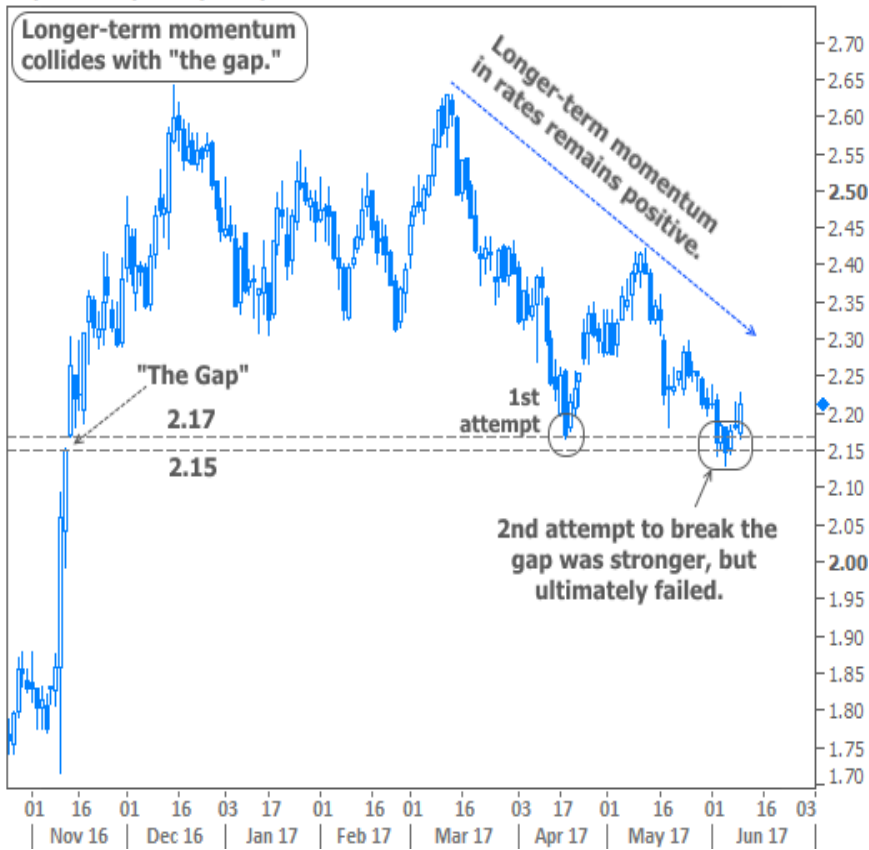
10yr Treasury Yield (Rates)

These sorts of gaps can be significant lines in the sand for investors. This particular gap corresponds to average mortgage rates near 4.0%. As such, 10yr yields will need to break well below 2.15% if we're to see widespread availability of conventional 30yr fixed rates in the high 3 percent range.