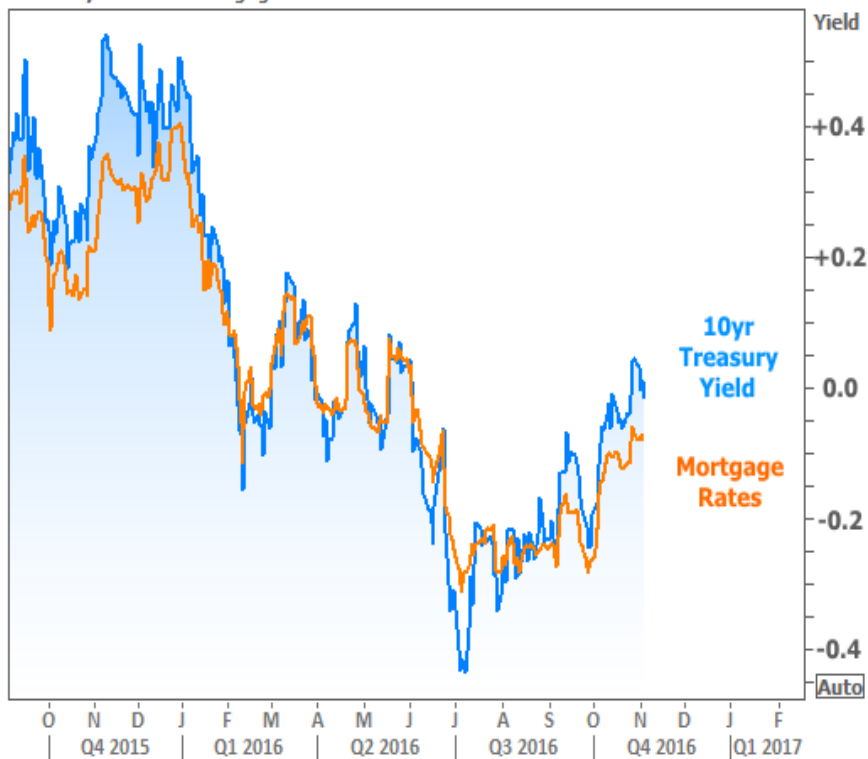
Treasury Rates vs Mortgage Rates

Bottom line: for any given amount of interest rate drama in the news, mortgage rates have been fairly well insulated. That will continue to be the case unless the moves get much bigger, and again, we're probably waiting until early December to find out if that will be the case.