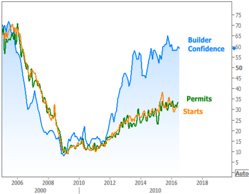
Builder Confidence, Housing Starts, Building Permits

The answer will likely vary depending on your individual outlook on the economy and the housing market. There are several forces at work here. One of the most frequently-cited is that it's simply in builders' best interest to build fewer, bigger houses for economic reasons. The other major consideration is the relative boom in multifamily construction. Both of these would help explain builders' ability to remain much more upbeat than residential construction numbers would suggest.