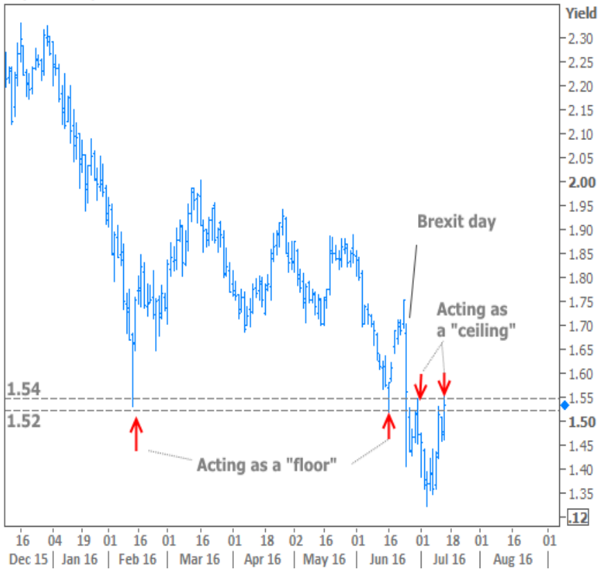
10yr Treasury Yields

Of course, when it comes to financial markets, repetitions of past patterns won't always predict the future. However, repetition does build a case for a certain level being significant. It's as simple as this: if rates hardly ever break through a given level, it's easier to argue that it means something when they do.