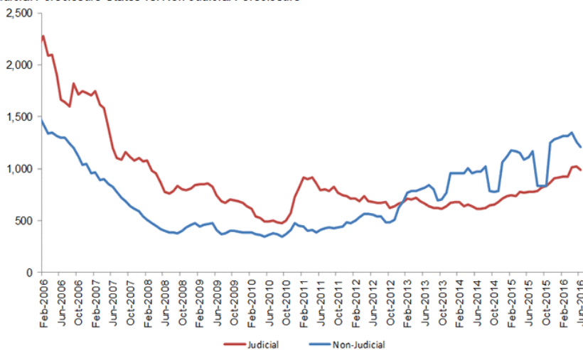
Figure 1 – Number of Mortgaged Homes per Completed Foreclosure Judicial Foreclosure States vs. Non-Judicial Foreclosure

Completed foreclosures increased by 5.1 percent to 38,000 in June 2016 from the 36,000 reported for in May. As basis of comparison, CoreLogic says completed foreclosures averaged 21,000 per month nationwide between 2000 and 2006 before the housing downturn began.