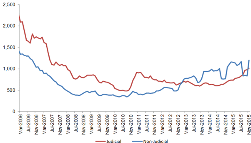
Figure 1 – Number of Mortgaged Homes per Completed Foreclosure Judicial Foreclosure States vs. Non-Judicial Foreclosure

The number of completed foreclosures nationwide in November was down to about 30 percent of the level in the worst days of the housing crisis. CoreLogic's monthly National Foreclosure Report puts completed foreclosures in November at 33,000 compared to 117,657 in September 2010. The November number is down 21.8 percent from November 2014 and is 10.9 fewer than the 38,000 completed foreclosures in October 2015. As a basis of comparison, between 2000 and 2006 completed foreclosures averaged 21,000 per month nationwide.