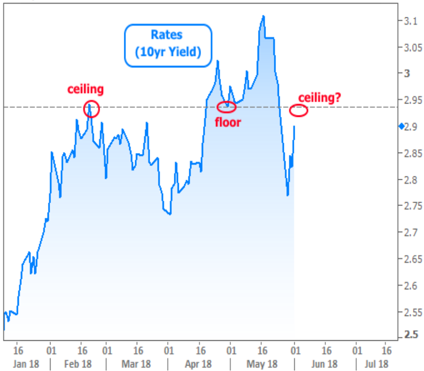
US 10yr Yields