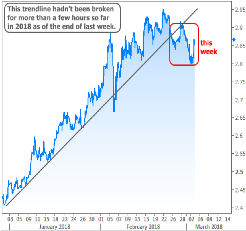
US 10yr Yield ("rates")