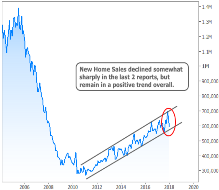
New Home Sales

Of course rates are far from the only input for home sales. As we discussed last week, inventory is an ongoing problem, as is affordability. The tariff news creates more uncertainty on that front. Tariffs could increase building costs and hinder the construction of affordable homes, according to Lawrence Yun, chief economist of the National Association of Realtors.