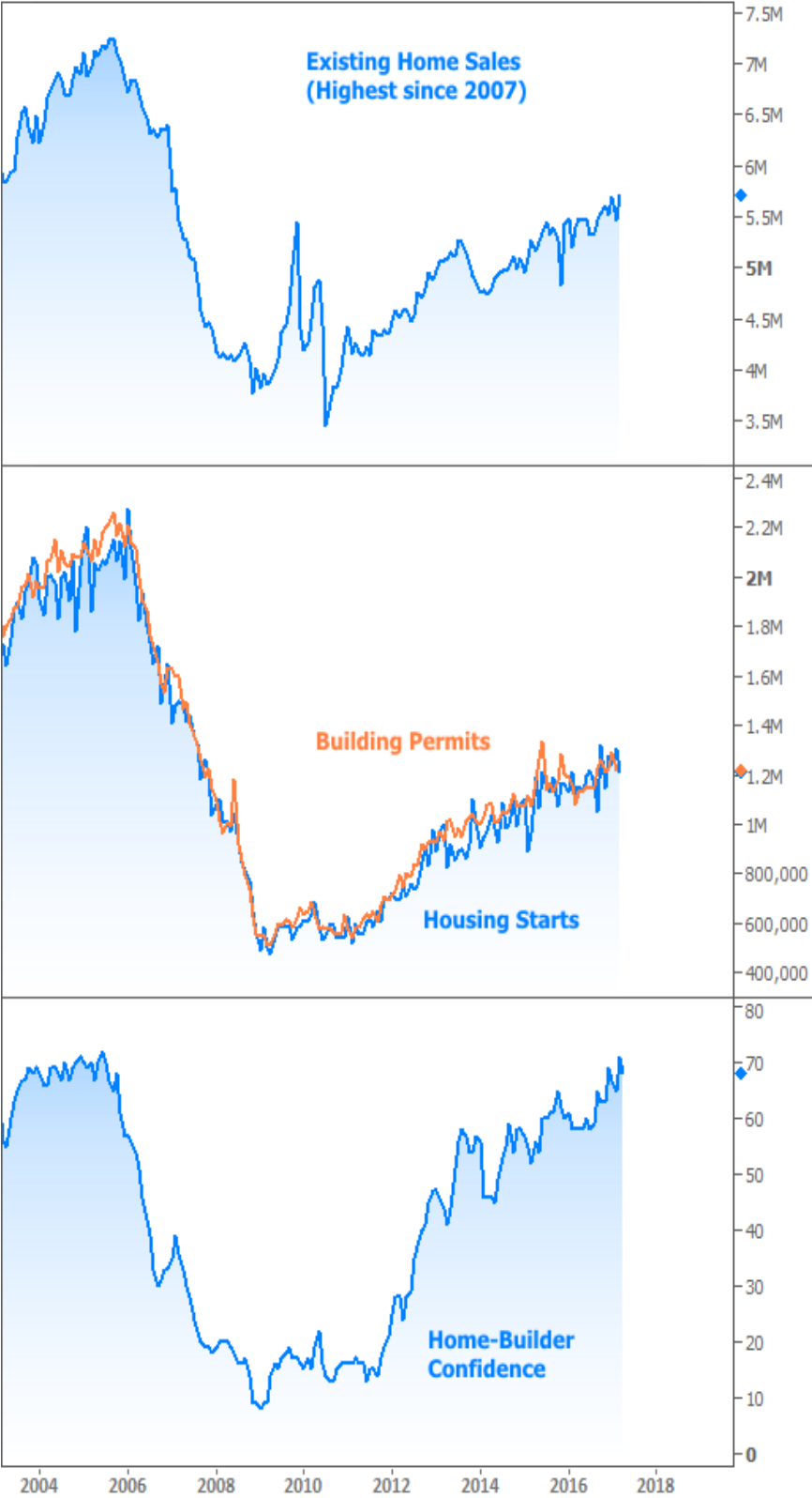
This Week's Housing Data

Subscribe to my newsletter online at: http://mortgageratesupdate.com/ericgousios