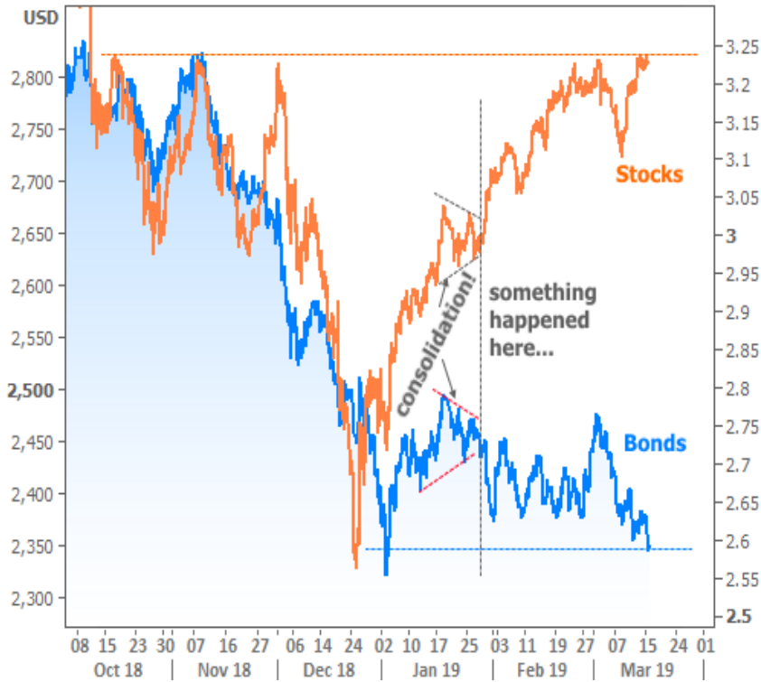
Rates vs Stocks

No, the Fed isn't getting ready to unveil another quantitative easing (QE) package, at least not directly. Indirectly, however, markets are about to feel the same sort of QE-driven euphoria. In fact, they've been feeling it for a few months now.