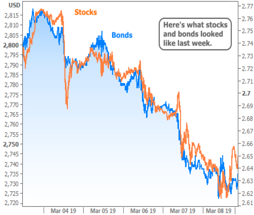
Rates vs Stocks

The next chart will incorporate all of the info above and add the current week to the mix using the same y-axis relationship from last week.