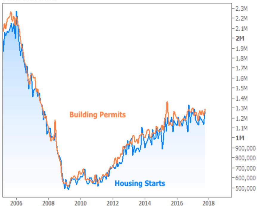
Starts and Permits

Even after the next round of data (which includes homes that COULD be affected by tax changes), we should remember two things. First, at least when it comes to Starts and Permits, the contracts for new construction and ground-breaking for November's numbers will largely have been in place before the November 2nd cutoff. Therefore, to whatever extent potential tax changes spook the housing market, we wouldn't see it in these numbers until January at the earliest.