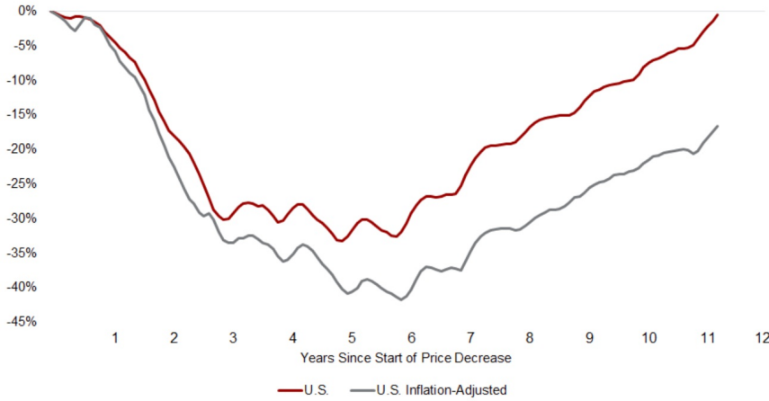
Change in Home Price Index Since Start of Declines (2006)

Boesel says inflation should also be factored into the pace of recovery. From the peak in housing prices through this past July, the inflation has totaled just under 18 percent. When home prices are adjusted for that, the trough was deeper , down 40 percent from the beginning of the cycle, and the recovery shallower; prices remain 17 percent off the peak.