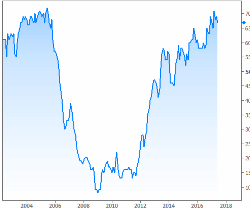
NAHB Housing Market Index

The HMI is constructed from responses to a survey NAHB has conducted for more than 30 years among its new-home builder members. They are asked to provide their perceptions of current single-family home sales and sales expectations for the next six months as "good," "fair" or "poor." The survey also asks builders to rate traffic of prospective buyers as "high to very high," "average" or "low to very low." Scores for each component are then used to calculate a seasonally adjusted index where any number over 50 indicates that more builders view conditions as good than poor.