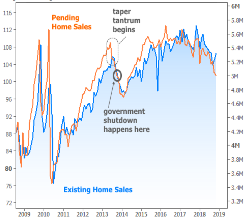
Pending and existing home sales

In the current case, things are a bit different. This time around the government shutdown hit during a fairly decent recovery in interest rates. It will give us a much better chance to see which one matters more. The only catch is that housing sales numbers for the time frame of the shutdown won't be out until later this month, and the most meaningful numbers won't be out until February or March.