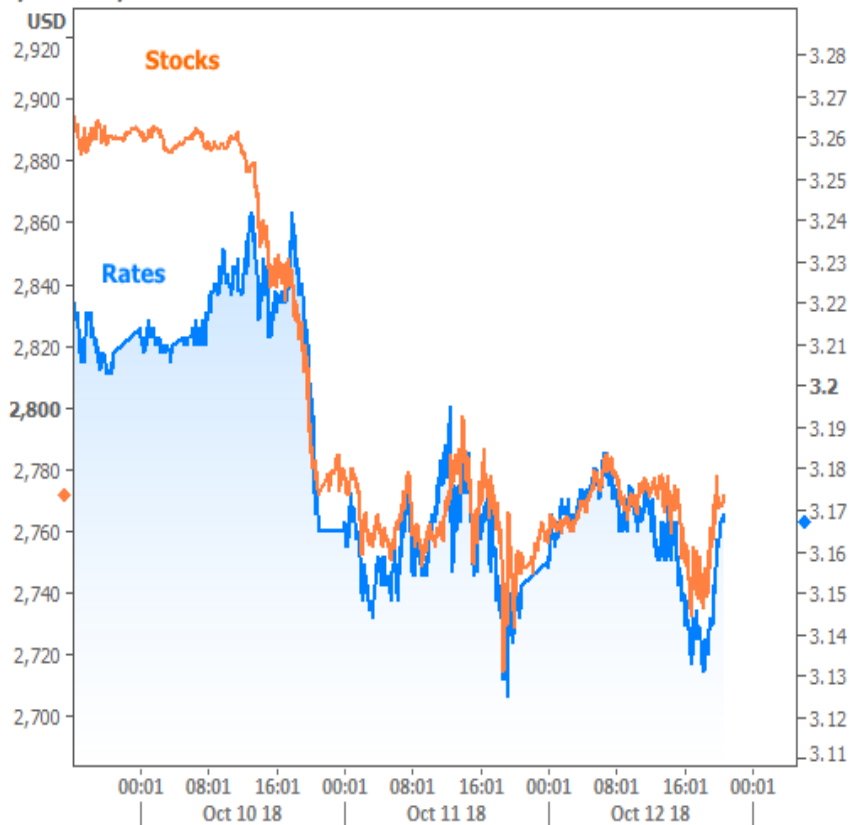
10yr Treasury Yield vs Stocks

The net effect was that mortgage rates fell back to their lowest levels since last Thursday by the end of the week. You may have seen news stories over the past two days talking about a "sharp move higher" in rates. This has to do with stale underlying data used by many media outlets to write their once-a-week mortgage rate article. The sharp move higher occurred LAST week , as we discussed at the time.