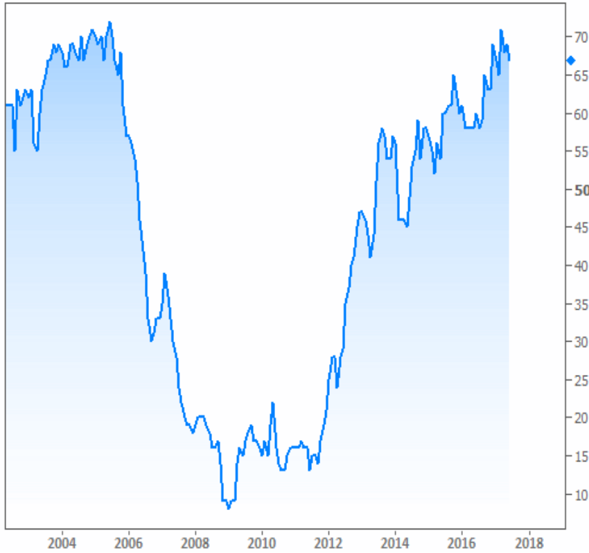
NAHB Housing Market Index

It's harder to offer a compelling counterpoint for Friday's New Residential Construction data from the Census Bureau. Both Housing Starts and Builder Permits came in well below forecasts, prompting National Association of Realtors' Chief Economist to say "housing shortages look to intensify and may well turn into a housing emergency if the discrepancy between housing demand and housing supply widens further."