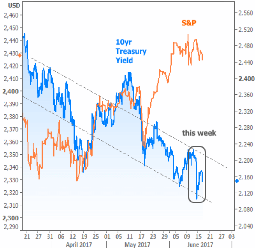
Rate Trend Remains Friendly

In housing-specific news, this week's economic data was generally downbeat . The National Association of Home Builders reported a drop in its Housing Market Index (a measure of builder confidence). In context, however, the index doesn't look like it's in trouble just yet.