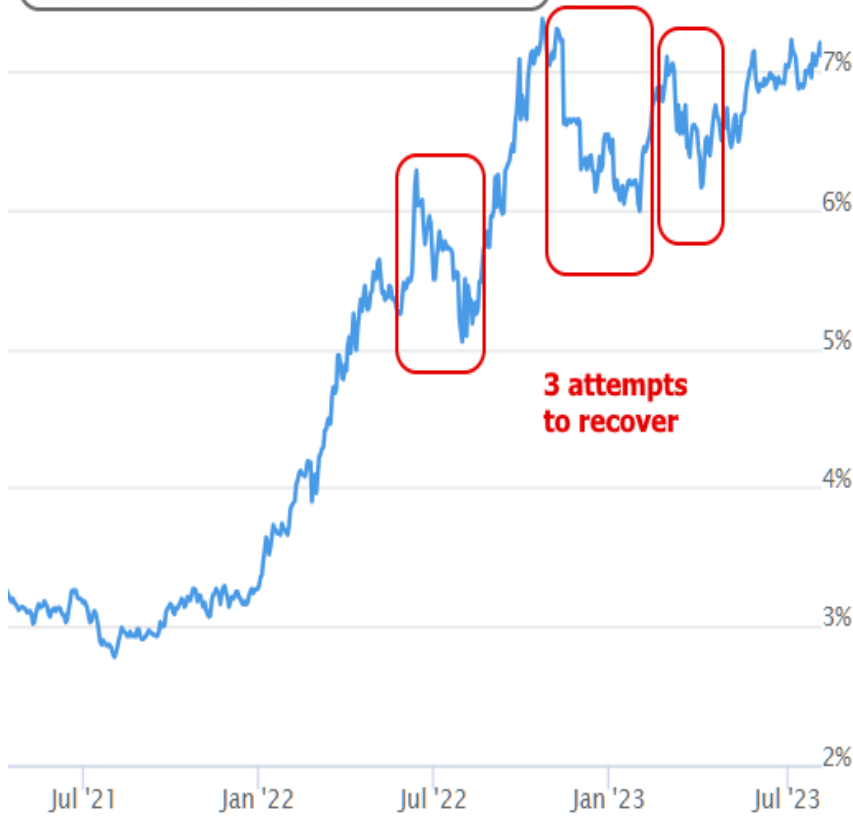
30yr Fixed Mortgage Rate Index, MND

Is there any hope for relief? There's always hope. The only question is one of timing. Timing will depend on economic data and inflation, among other things. Markets got a glimpse of just that sort of relief on Friday following the big jobs report from the Labor Department. It was still very strong in a historical context, but not quite as strong as economists had predicted.