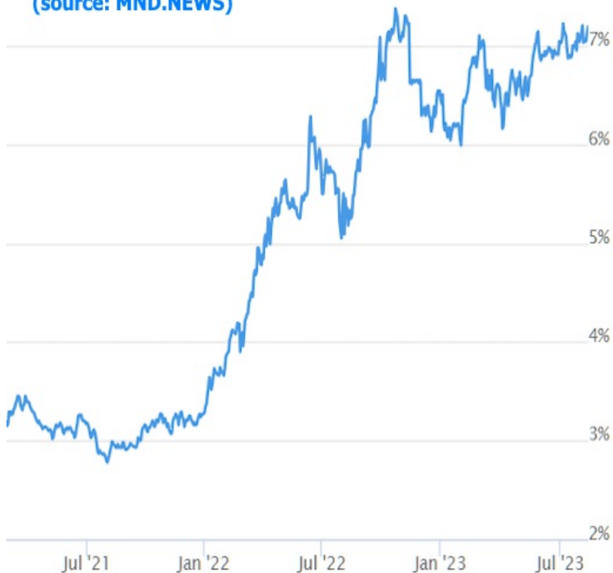
30yr fixed mortgage rate index

This is the new and persistent reality until one of 3 things happens: