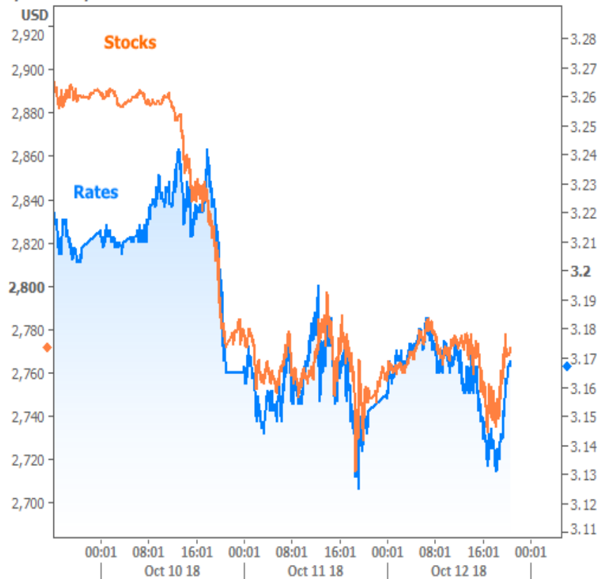
10yr Treasury Yield vs Stocks

The net effect was that mortgage rates fell back to their lowest levels since last Thursday by the end of the week. You may have seen news stories over the past two days talking about a "sharp move higher" in rates. This has to do with stale underlying data used by many media outlets to write their once-a-week mortgage rate article. The sharp move higher occurred LAST week, as we discussed at the time .