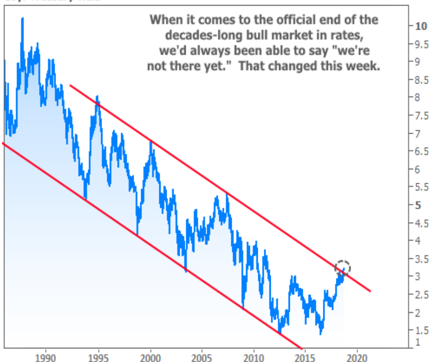
10yr Treasury Yield