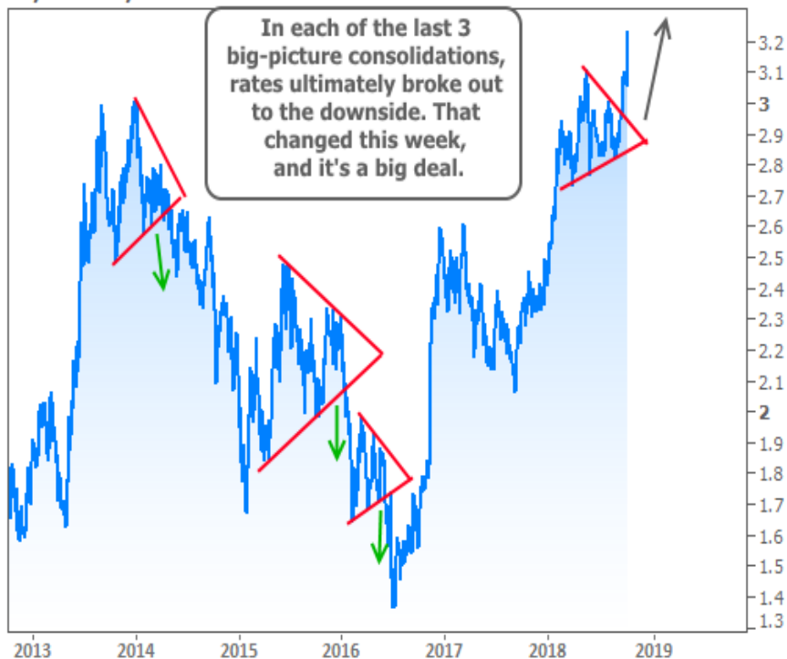
10yr Treasury Yield

On an even grander scale, this week is the first time in decades that we can't simply fall back on the fact that rates were still inside the super-long-term downtrend seen below.