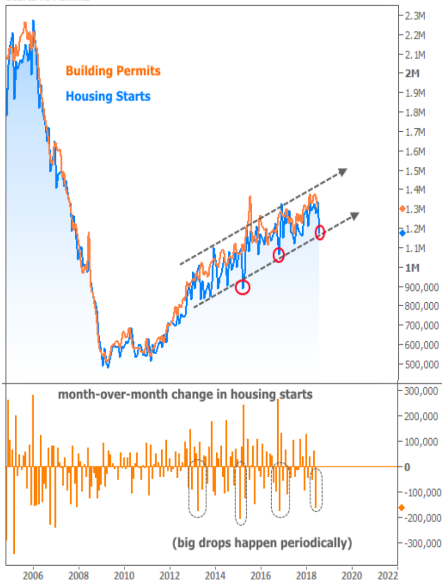
Starts vs Permits

Big drops in housing starts happen from time to time. And despite this particular drop, a positive trend remains intact.