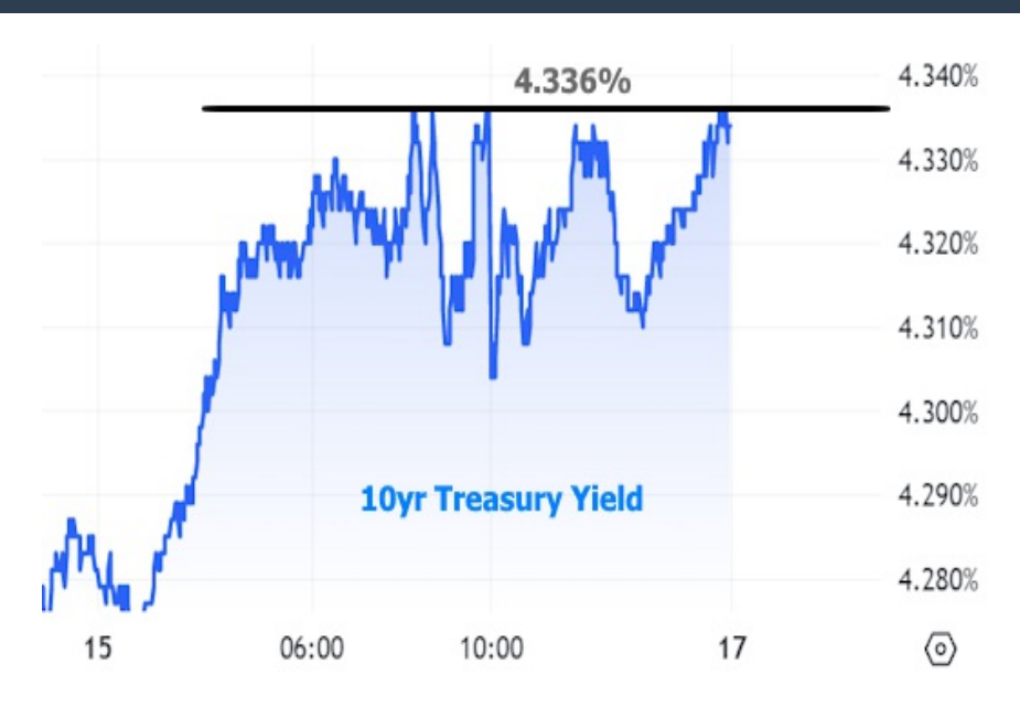
4.34% is where the 10yr ended on August 21st. It remains the highest daily closing level since 2007 so repeated flirtation is important. When a bond yield (or any other financial market security, for that matter) exhibits this bouncy behavior around a previous extreme, it becomes known as a "technical level" by a large portion of the trading community.

Technical levels go by many names (key level, pivot point, inflection point, or simply "ceiling"). A technical level can be a ceiling if it acts like a ceiling, but it can be an inflection point if it is subsequently broken.