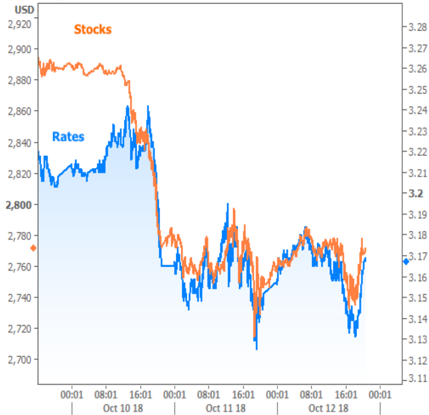
10yr Treasury Yield vs Stocks

The net effect was that mortgage rates fell back to their lowest levels since last Thursday by the end of the week. You may have seen news stories over the past two days talking about a "sharp move higher" in rates. This has to do with stale underlying data used by many media outlets to write their once-a-week mortgage rate article. The sharp move higher occurred LAST week, as we discussed at the time .