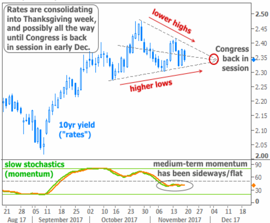
US 10yr Treasury Yield

In the spirit of "waiting and seeing," interest rates improved slightly this week. This keeps them locked in a consolidative trend (higher lows and lower highs) that's been underway for more than a month. It's the bond market's way of expressing indecision, and for now, the trend suggests indecision could linger at least through early December. Even if we apply some esoteric math to recent rate movement and derive a line that measures momentum, that line has been almost perfectly flat for several weeks.