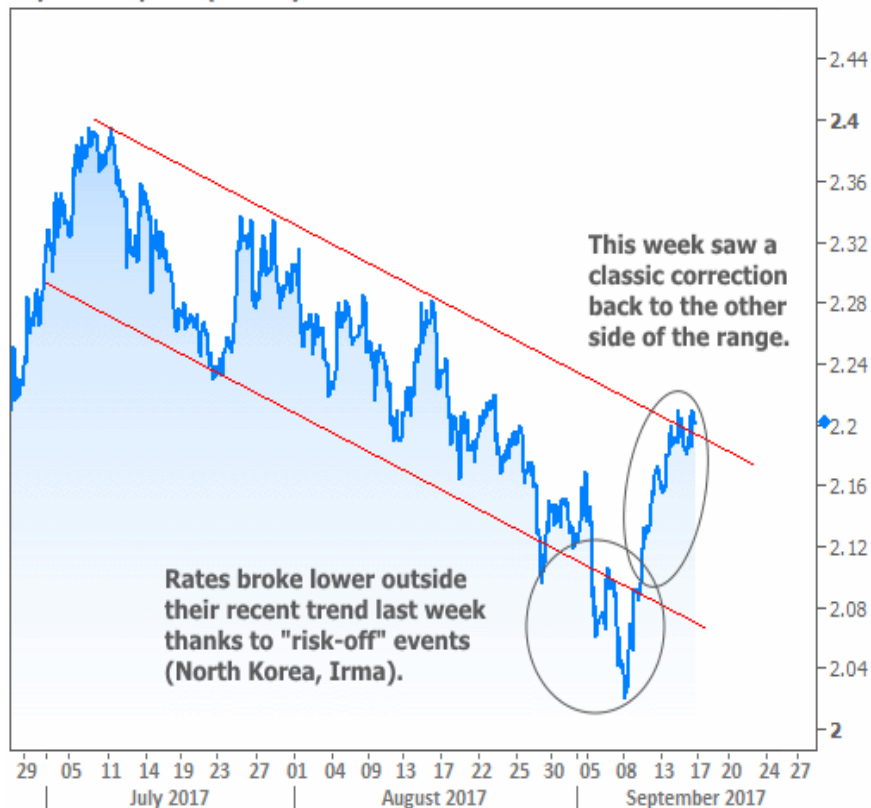
10yr Treasury Yield ("Rates")

The bulk of the correction took place during the first 3 days of the week. Rates found a supportive ceiling around 2.22% in terms of 10yr yields, but weren't interested in moving much lower for a few reasons. The most obvious reason would be that last week's gains were based on temporary factors.