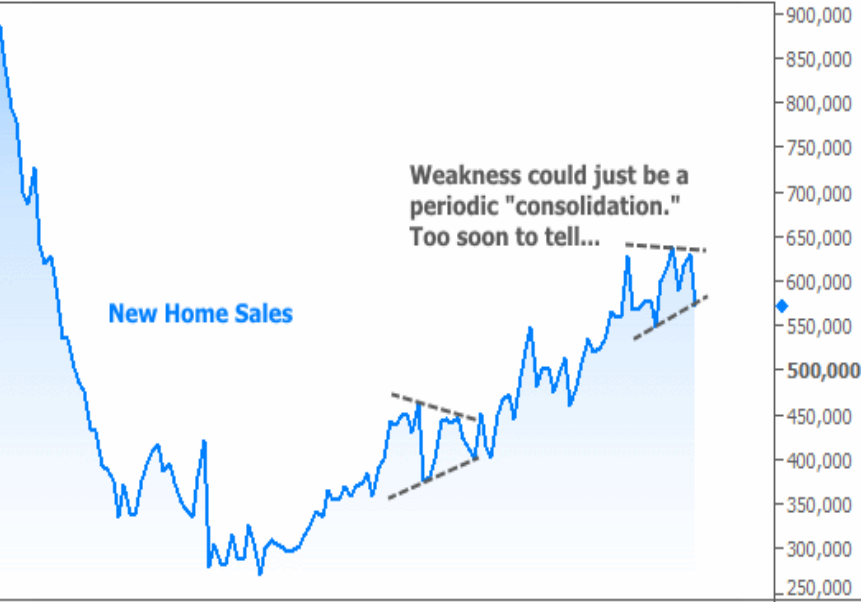
New Home Sales