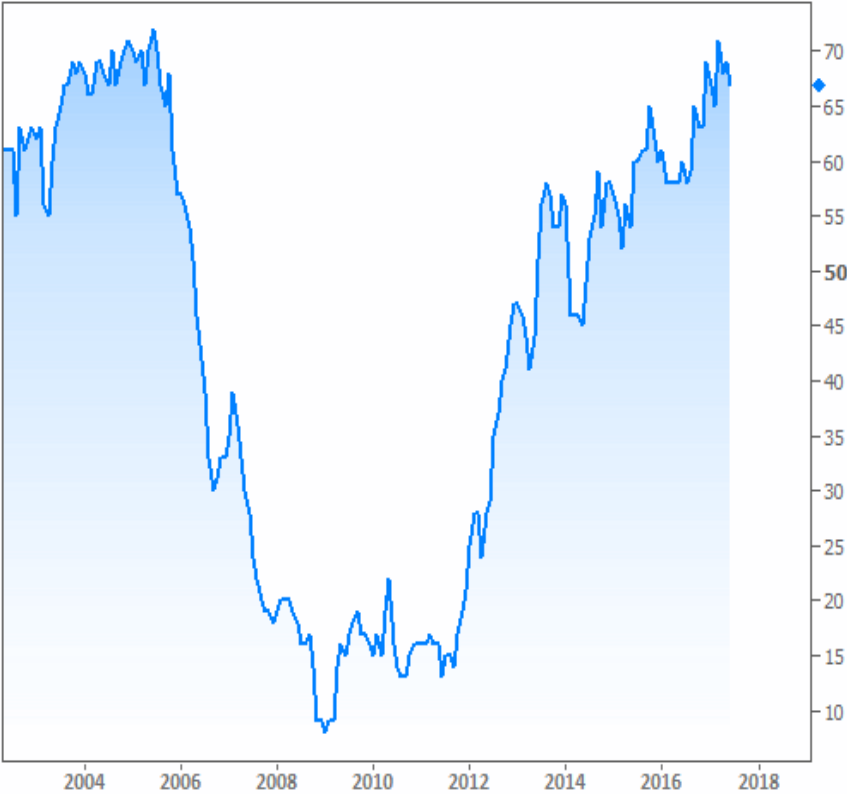
NAHB Housing Market Index

It's harder to offer a compelling counterpoint for Friday's New Residential Construction data from the Census Bureau. Both Housing Starts and Builder Permits came in well below forecasts, prompting National Association of Realtors' Chief Economist to say "housing shortages look to intensify and may well turn into a housing emergency if the discrepancy between housing demand and housing supply widens further."