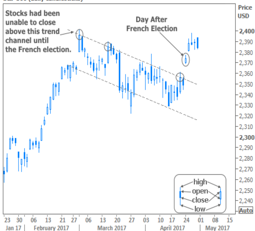
S&P 500 (daily candlesticks)

We might take the stock breakout with a grain of salt for a few reasons. First of all, it's earnings season, which often provides some extra levity. From a technical perspective, the S&P (the index of choice among traders) was unable to break above March 1st's all-time highs. If that ceiling remains intact, stock traders will increasingly think about checking out the lower side of the range. To whatever extent that happens, bond markets would reap some of the benefits of the money flowing out of stocks (more bond buying = lower rates).