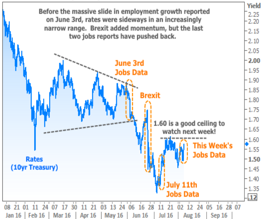
Rate Momentum Heading Into August

Now that we have a 2nd consecutive jobs report coming in so strong, the question is: will the upward momentum in rates be that much stronger? In considering that possibility, it will be useful to keep an eye on the low 1.6% range in 10yr Treasury yields, as that has been an important ceiling recently. When rates continually bounce against such ceilings, it's the market's way of letting us know it would be important if the ceiling ends up being broken.