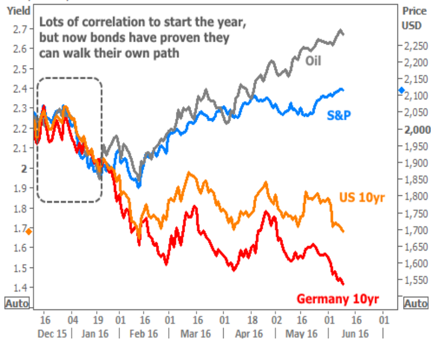
Rates, Stocks, Oil

The bottom line is that the burden of proof is on the economy and inflation when it comes to making a case for higher rates. Certainly, the Fed would like to be able to raise rates, but hurdles keep coming up. If this continues, it won't be long before we see new all-time low mortgage rates--a fact that's interesting to consider in light of one piece of analysis this week.