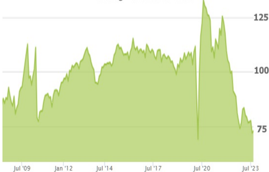
Pending Home Sales Index

Both charts convey post-covid volatility, but one says the housing market is stable and improving while the other says it's as bad as it's been in decades. How can two reports on home sales tell such different stories?