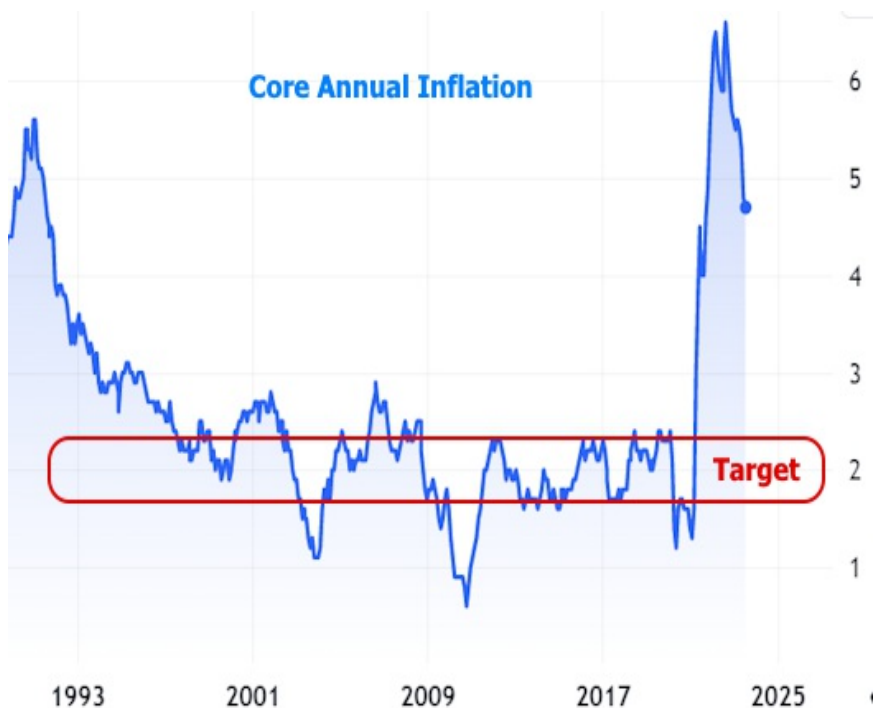
Core Annual Inflation

It's also worth noting that the Fed is well aware of the progress, but their inflation targets are expressed in ANNUAL terms. They would point out that our observation above about inflation being at levels consistent with "just right" is only true if nothing changes over the next 9-10 months. As of today, annual inflation is still way too high.