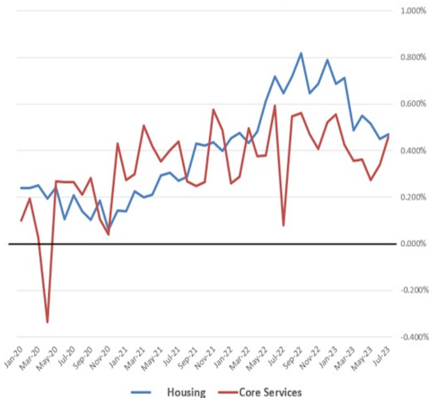
month over month % Change

It's also worth noting that the Fed is well aware of the progress, but their inflation targets are expressed in ANNUAL terms. They would point out that our observation above about inflation being at levels consistent with "just right" is only true if nothing changes over the next 9-10 months. As of today, annual inflation is still way too high.