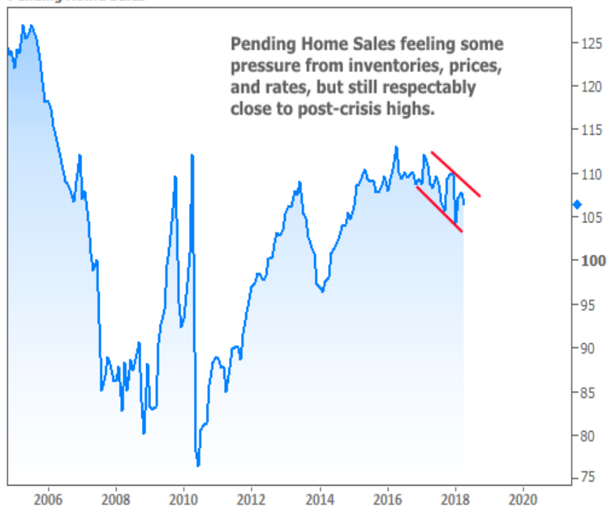
Pending Home Sales

Subscribe to my newsletter online at: http://mortgageratesupdate.com/mattstoutmortgagenavigator