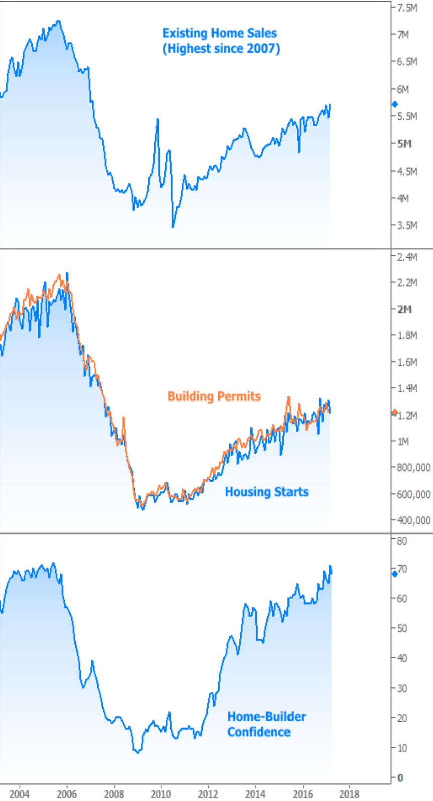
This Week's Housing Data